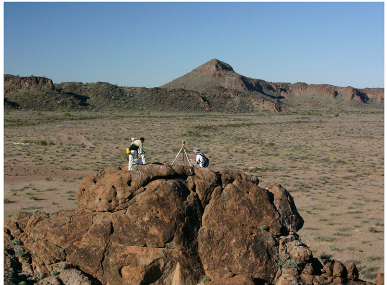
Fig. 1. Public support can expand archeological finds and help tell the stories of people and places. Here, archaeological surveyors work in the Western Papaguera of Arizona. After laws protecting archaeological sites were passed in 1966, the number of recorded sites in the region ballooned from 100 to more than 2,000, which allowed researchers to document 10,000 years of human occupation in one of the hottest, driest parts of the United States.

Many nations have laws protecting cultural heritage, and as a result, archaeologists have access to far more data than ever before. In the United States alone, since the federal government started keeping systematic records in 1985, archaeologists have surveyed more than 140,000,000 acres, recorded more than 880,000 archaeological sites and excavated more than 35,000 of them, curated more than 900,000,000 artifacts and related items (1), and spent tens of billions of dollars (2). In the United States, archaeological investigations are